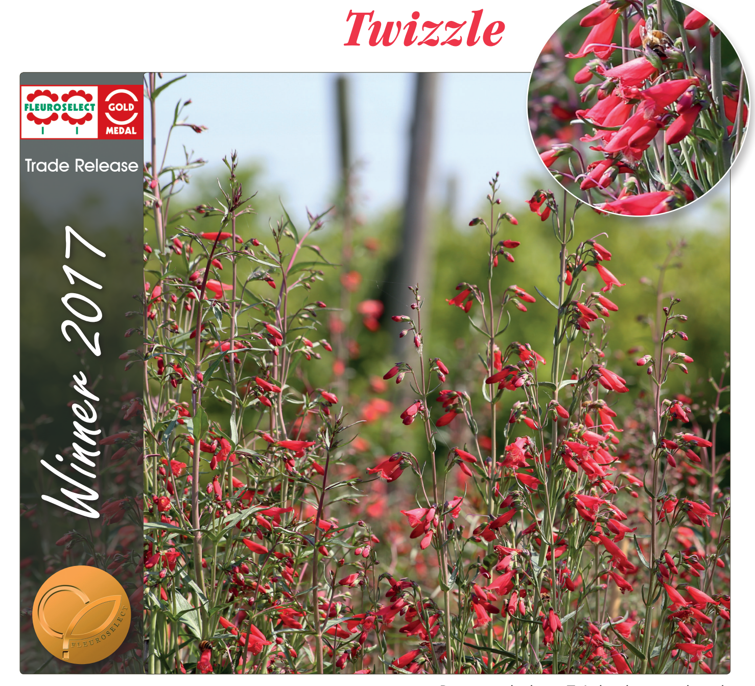
Penstemon barbatus Twizzle: elegant and sturdy

This first year flowering perennial from Van Hemert & Co. has taller flower stems than the existing varieties on the market while preserving the natural elegance of wild Penstemon. The half-high flower spikes (approx. 70-80 cm) present small bell-shaped flowers in vivid scarlet. Twizzle is a beautiful border plant thriving in a sunny spot and well-drained soil. It blooms over a long period, stretching from summer to autumn and attracts beneficial insects in the garden. Twizzle is the perfect strong, but gentle touch for pots, containers and bedding.